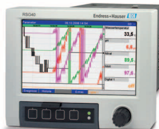
Memograph M with 7-inch TFT display