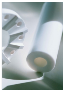
APSOplast® Engineering Plastics Technology