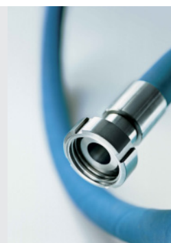
APSOfluid® Fluid Handling Technology