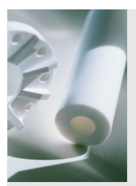
APSOplast® Engineering Plastics Technology