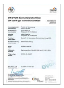
ASSIWELL® hose lines for gas supply to DIN 3384