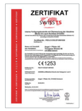
ASSIWELL® hose lines for pressure applications to derective 97/23/EG