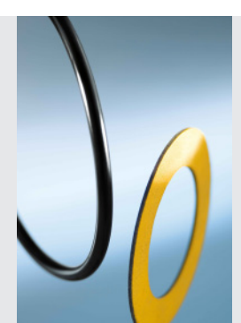
APSOseal® Sealing Technology