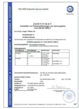
ASSIWELL® welding of rail vehicles to DIN EN 15085-2 CL1